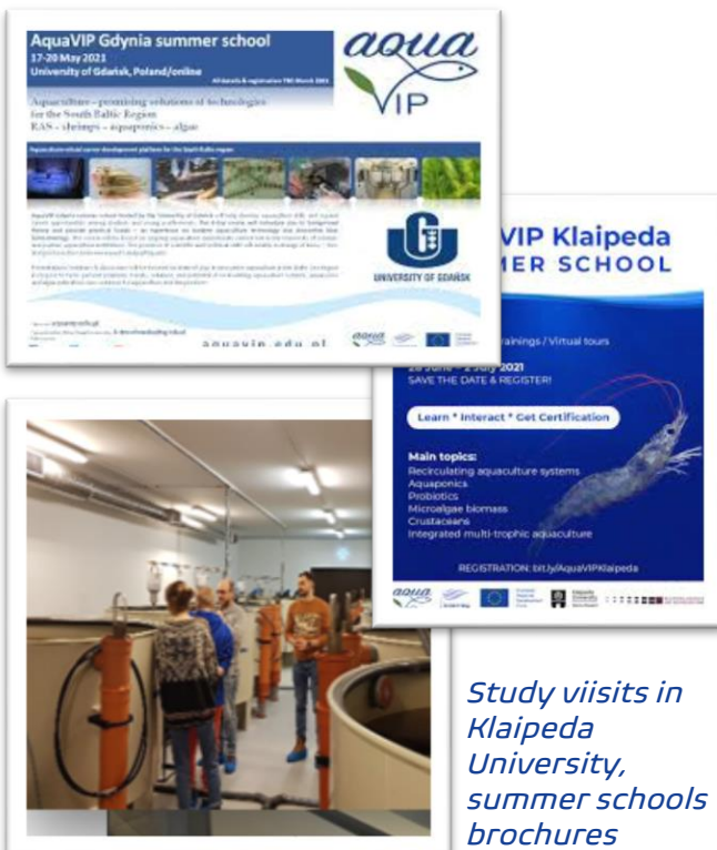
Study viisits in Klaipeda University, summer schools brochures